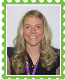
Head of Year