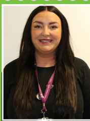
KS3 Head of Year