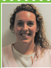
Head of Year