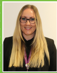
Head of Year