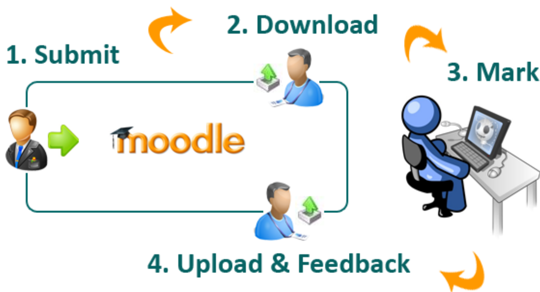
Figure 1 - Steps in the e-Assessment process