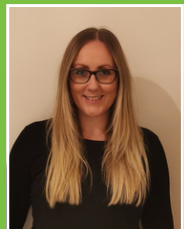
Head of Year