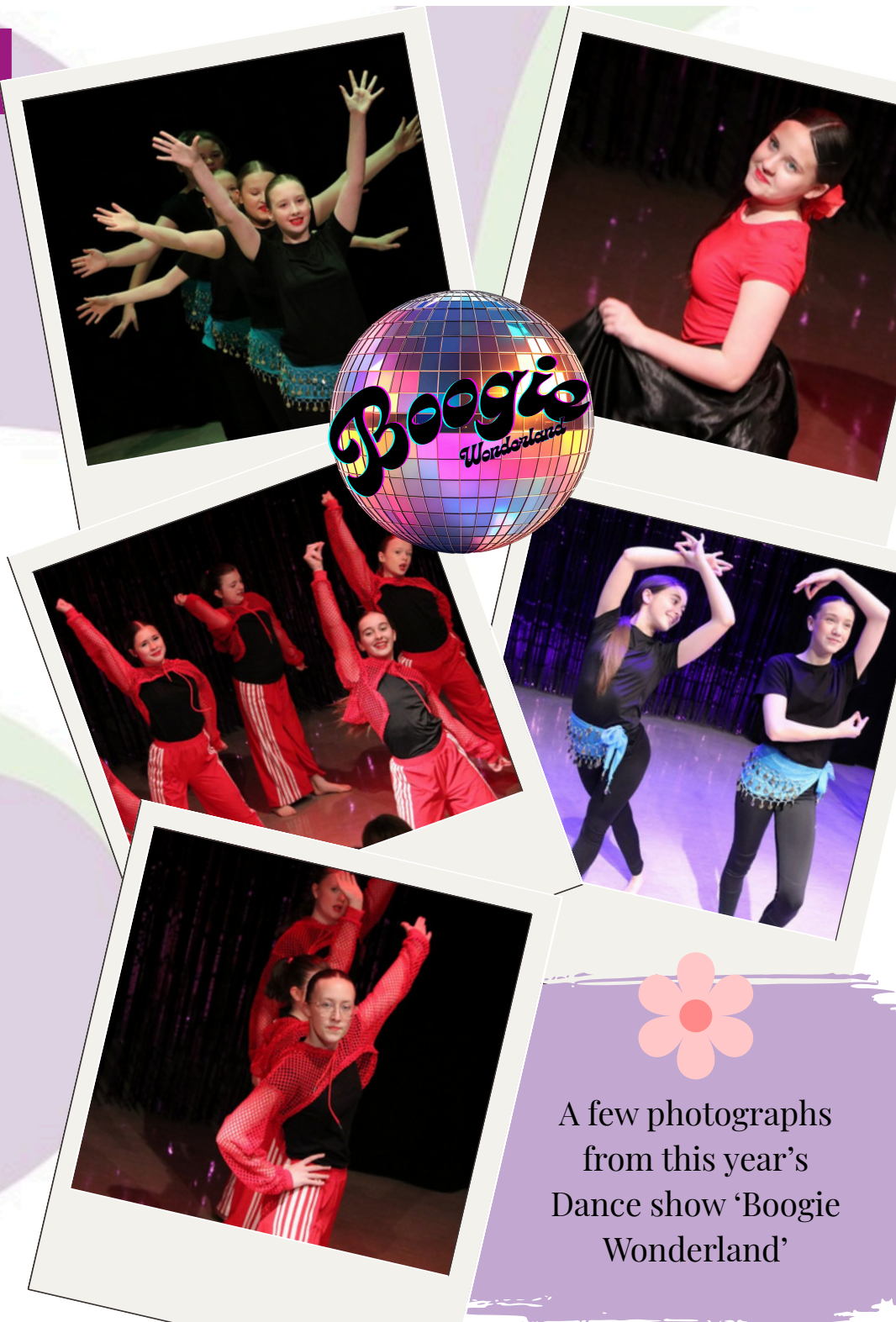
A few photographs from this year's Dance show 'Boogie Wonderland'

Please support us by encouraging your child to participate in one or more of these opportunities. The full extra-curricular timetable is available via the link on our website.