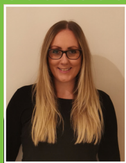
Head of Year