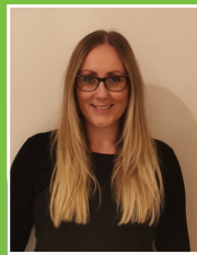
Head of Year