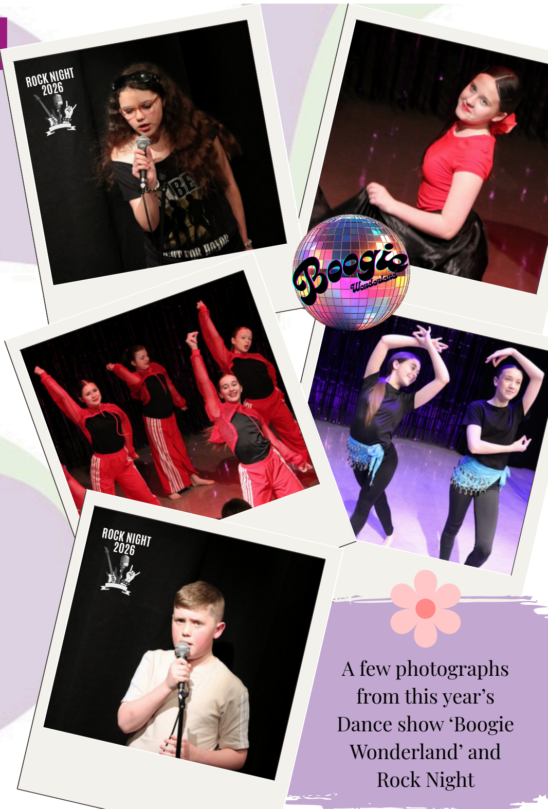
A few photographs from this year's Dance show 'Boogie Wonderland' and Rock Night

Please support us by encouraging your child to participate in one or more of these opportunities. The full extra-curricular timetable is available via the our website.