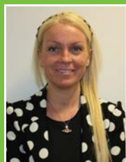
Head of Year