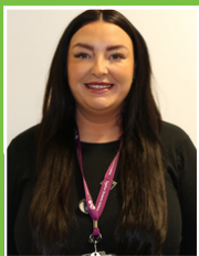
KS3 Head of Year