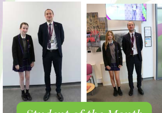
Student of the Month