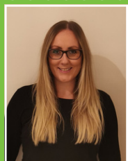
Head of Year