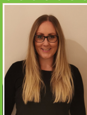
Head of Year