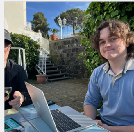
Year 13 Geography Students working hard on their recent trip to Naples.