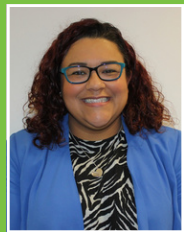
Director of Sixth Form